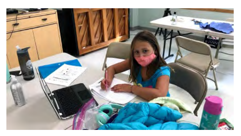
"Wow, I like this a LOT better than regular school!" --student

"At the end of the day, we have kids crying because they don't want to go home. Parents come in and tell us that their child is so excited to come to [the hub]. They keep track of days because they like the full days because they have more time to play with their friends after they get their school work done."